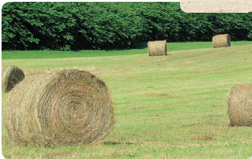
Protection of hay fields is critical.