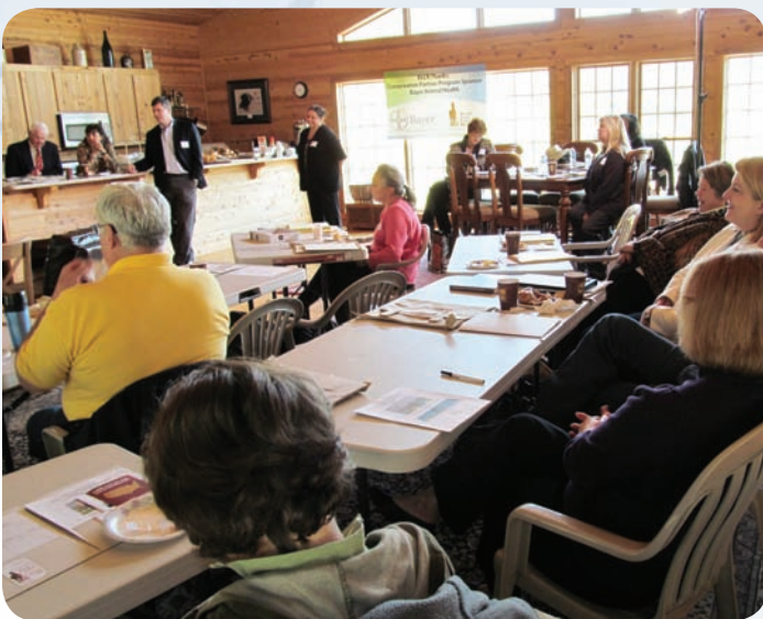
Participants at the Atlanta area forum