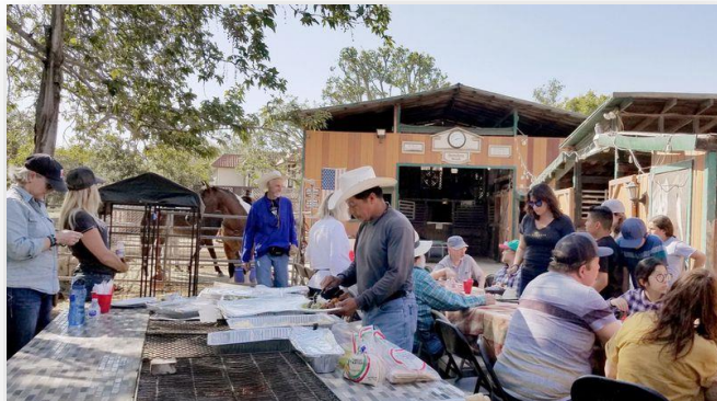
Silver Spur Stable hosts many family and youth-oriented events, making the stable an important social contributor to the community.

Silver Spur Stables is located at the center of Riverside Rancho, adjacent to a community equestrian bridge that leads riders into Griffith Park. Within the Park is the Los Angeles Equestrian Center, a large facility that hosts between 40-50 national and international equestrian events per year. There is a strong community support system, and much equestrian traffic utilizing the bridges and access points between the communities.