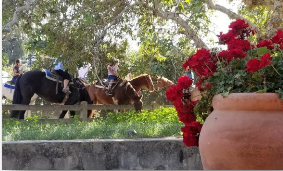
Riders accessing Griffith Park Equestrian Trails at Riverside Rancho in Glendale, California.

Riverside Rancho in the City of Glendale, California is a unique equestrian community, one of several in the Los Angeles area. Silver Spur Stables is a long-time favorite riding facility in this community. Its potential loss to development would impact this equestrian area in many ways. To prevent this, a group of determined individuals started an organization to save Silver Spur Stables from rezoning in favor of a 21-unit condominium complex.